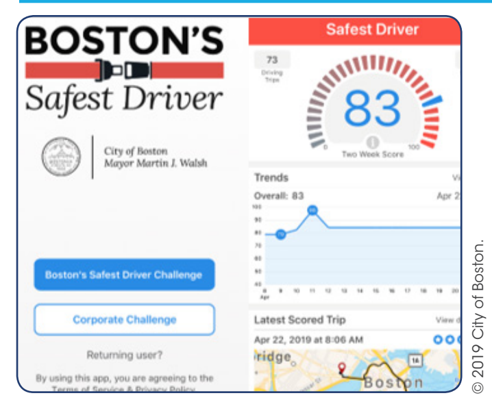
Figure 2. Graphic. Boston scoring dashboard.