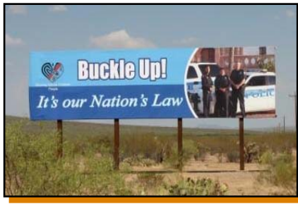
The Tohono O'odham Nation used this billboard to communicate its safety message.