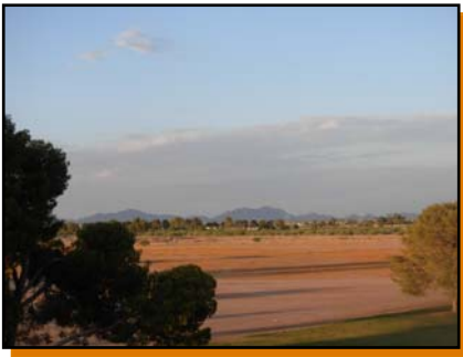
The Summit location: Casa Grande, Arizona.