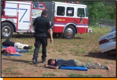
The White Mountain Apache Tribe held this mock motor vehicle crash at a high school to educate teens about the dangers of drunk driving.

A final theme discussed at the Summit was the need for training and education. Education is crucial to raise awareness of safety issues among tribal members, including young children, teens, parents, tribal leaders, and many others.