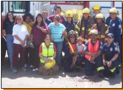
White Mountain Apache Tribe safety partnership team.

ITCA, with support from GTSAC, is expected to use the ranked priorities listed above to develop a program of solutions and projects. This will allow ITCA and the other members of GTSAC to focus their work on the most pressing issues affecting Indian country in Arizona.