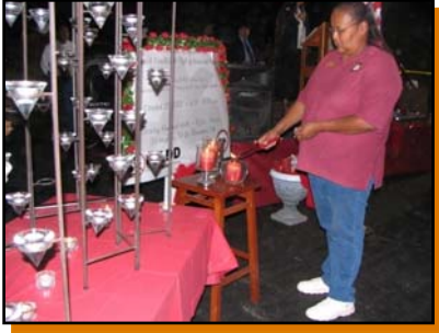
The San Carlos Apache Tribe held this candlelight vigil to honor a child killed in a traffic crash.

There are many tools available to help understand and document safety problems, ranging from quantitative techniques such as crash data analysis to qualitative techniques such as observation, interviews, and focus groups. Some examples discussed at the Summit include the following: