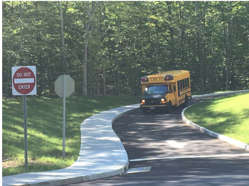
CDC Traffic Rehabilitation Safety Project, Mashantucket Pequot Tribe, Connecticut