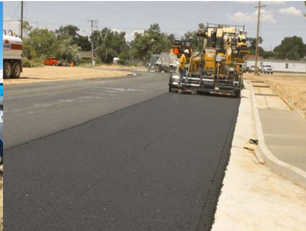
Project 301(2) Overlay Paiute Indian Tribe of Utah

Any facility that provides access to or is located within Tribal lands is eligible to be included in the National Tribal Transportation Facility Inventory (NTTFI). These roads, trails, bridges, and other facilities provide safe and adequate transportation for public access to, within, and through Indian reservations and native communities for Native Americans, visitors, recreational users, resource users, and others, while contributing to the health and safety and economic development of Native American communities. There are currently more than 161,000 miles of roads on the NTTFI. Approximately 31,500 miles are identified as being BIA routes and another 27,000 miles as Tribal routes. The remaining mileage is owned by others including States, counties, townships,