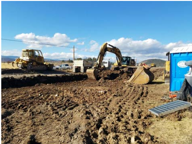
Spring Ridge Road SIR14-003 Susanville Indian Rancheria, California

Under the Fixing America's Surface Transportation (FAST) Act, the TTP was authorized at a funded level of $465 million in FY 2016. Except for a 5 percent set aside for FHWA and BIA to carry out stewardship and oversight of the program, all other TTP funding is provided to Tribes either as Tribal shares or as special set-aside funding to address transportation planning, as well as safety and bridge projects and activities. The Tribal shares are determined via a statutory funding formula that can be found at Title 23 United States Code (U.S.C.), section 202(b). The TTP is an important resource of a Tribe's overall infrastructure investment strategy. The regulations for carrying out the TTP can be found at 25 CFR Part 170.