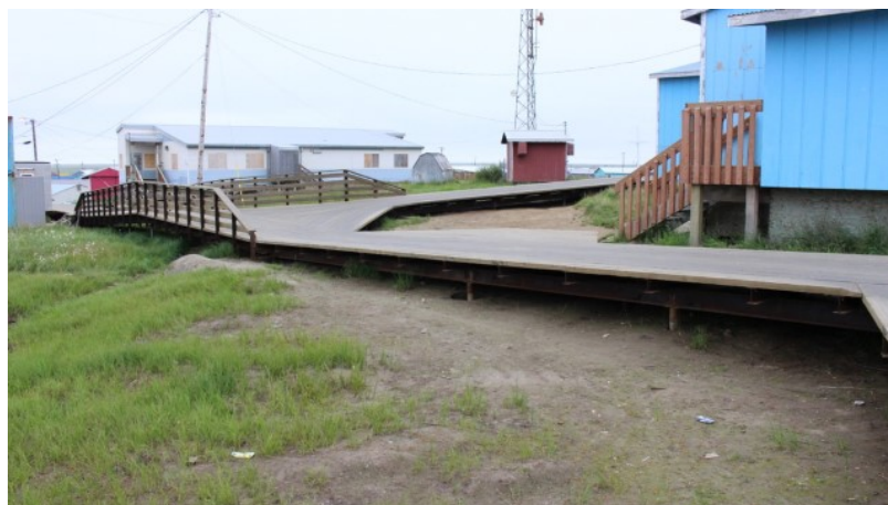
Completed Board Road Project, Chevak, Alaska