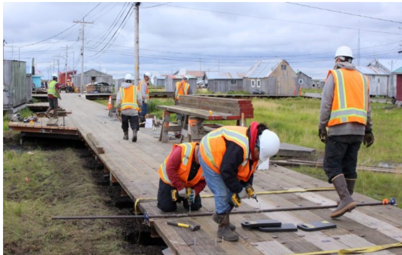
Board Road project construction, Kongiganak, Alaska

To provide safe and adequate transportation and public roads that are within, or provide access to, Tribal land, or are associated with a Tribal government, visitors, recreational users, resource users, and others, while contributing to economic development, self-determination, and employment of Indians and Alaska Natives.