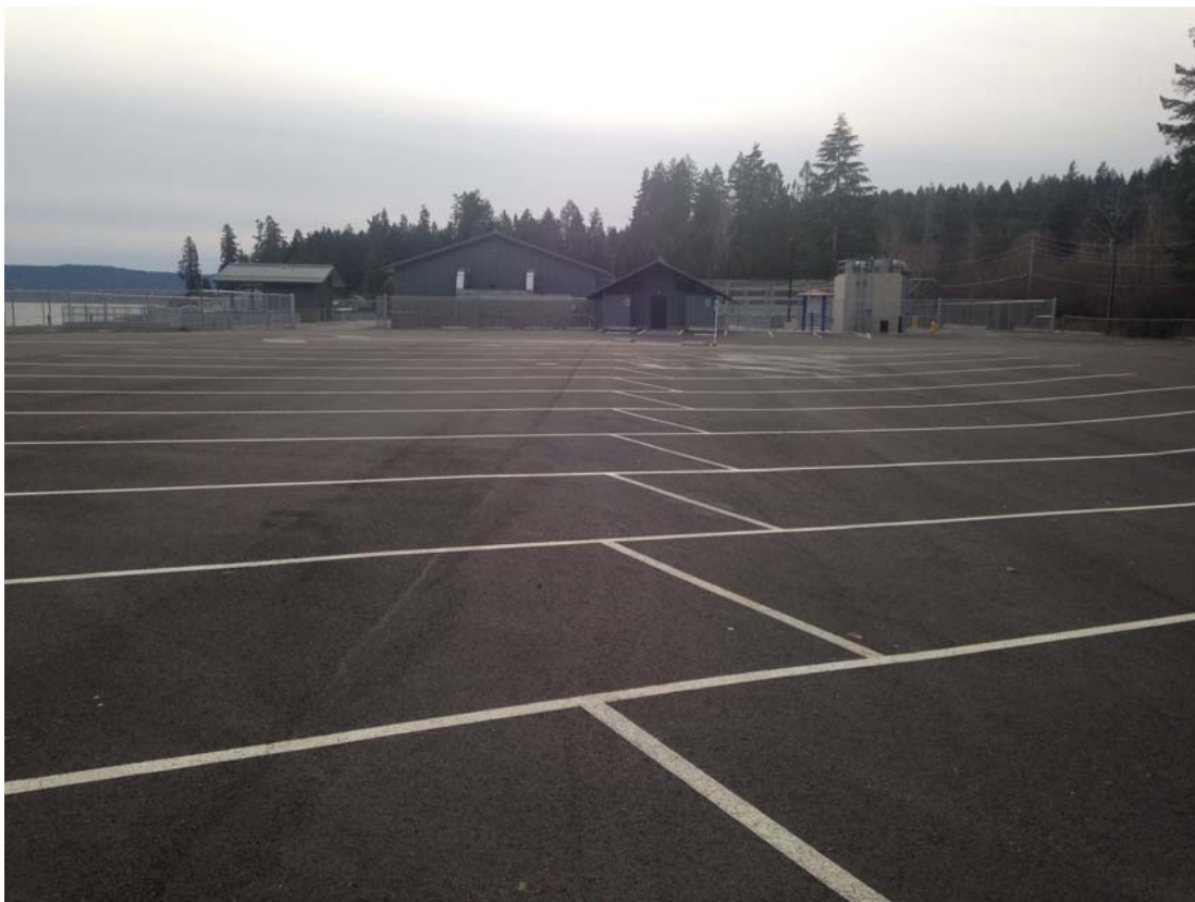
US101 Saltwater Park Cultural Rest Area, Skokomish Indian Tribe of the Skokomish Reservation, Washington

The report lists the Tribes in alphabetical order. The Chapter 3 Report is included in this report as Attachment C. Additional information/data on the specific bridge projects and safety projects contained in the Chapter 3 Report are included in this report as Attachments D and E. The funding and jobs associated with these activities are included in the information contained in the Chapter 1 Report.