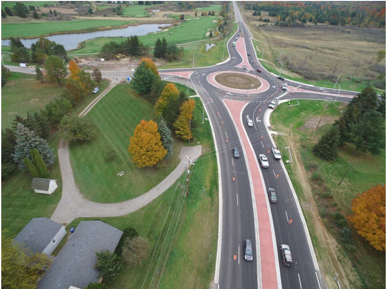
M-72 Roundabout/Turtle Creek L Drive. Grand Traverse Band of Ottawa and Chippewa Indians, Michigan