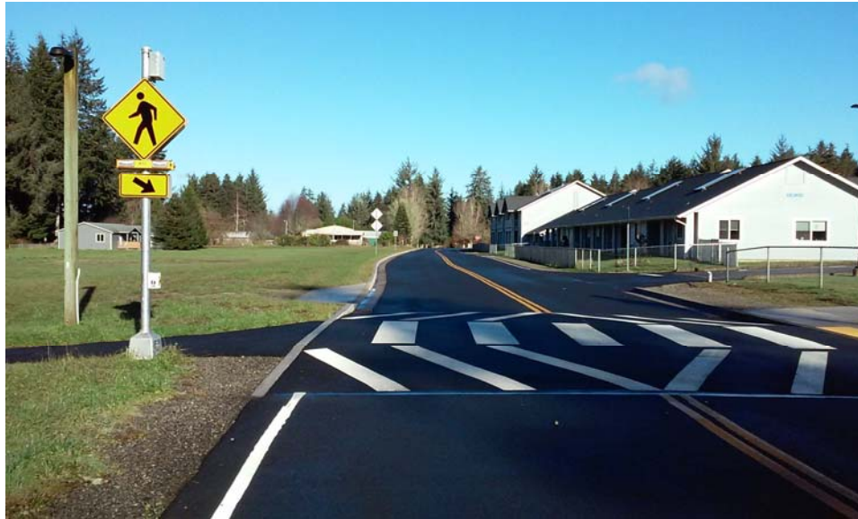
Gwee-Shut Road Sidewalks Project, Confederated Tribes of the Siletz Reservation, Oregon

with statutory and regulatory requirements. In FY 2016, 170 Tribes carried out their TTP under G2G Agreements.