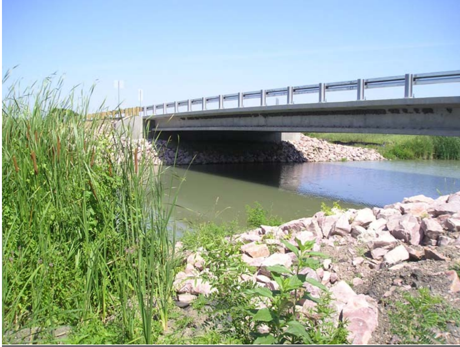
Campbell Creek Bridge Replacement, Crow Creek Sioux Tribe, South Dakota