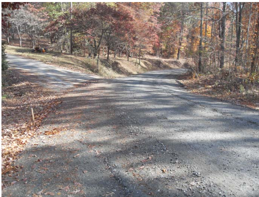
Echota Church Rd Project, Eastern Band of Cherokee Indians, North Carolina

minimize the data entry work required of the Tribes. The Joint Agency Report System (JARS) is a Microsoft Access database that was used to collate and present the collected data into automated reports.