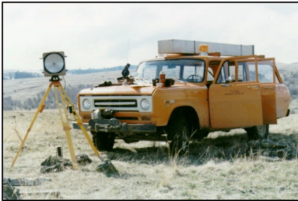
An electrotape set up beside a BPR vehicle on a 1973 project.

"You'd measure from both directions. Sound travels so many feet per second, so then you could determine" the distance, he explained. "Hewlett Packard made an instrument that would measure by laser, (and) we would check it with the Electrotape." The instruments were accurate: "maybe a ½ inch or ¾ inch difference."