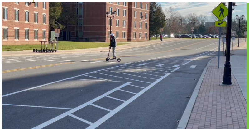
A person uses an e-scooter to cross the street.

The growth of micromobility vehicles (transportation devices such as pedal-driven and electric-assist bicycles as well as electric-assist scooters) in the United States over the past decade has been staggering. From 2010 to 2019, shared micromobility vehicle ridership ballooned from 321,000 trips annually in 2010 to 136 million annually in 2019. 1 In 2020, travelers in the United States took an estimated 67.9 million trips on shared micromobility vehicles. 2