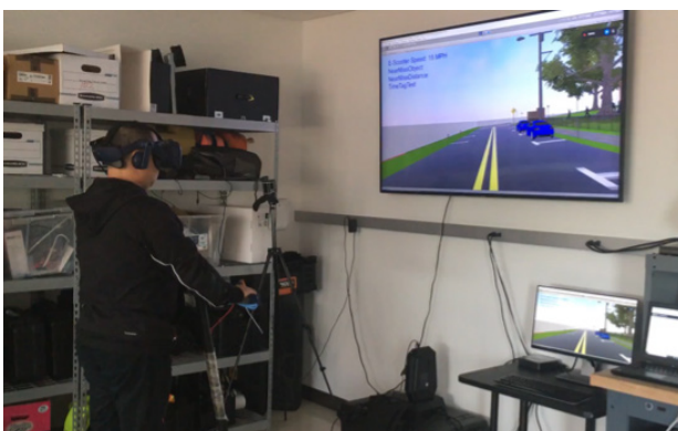
The three-dimensional simulation system for detecting near-miss incidents being developed in the Rutgers University research project.

For this part of the project, the research team will evaluate the current infrastructure for signage, educational material, and events related to pedestrian and micromobility rider safety in the communities surrounding the Rutgers University campus and other communities in New Jersey, such as Asbury Park and Newark. The researchers will also experiment with alternative low-cost road design approaches to reduce hazardous road conditions for pedestrians and micromobility users, such as employing traffic cones and restriping traffic lines. These behavioral interventions will be evaluated with video imaging.