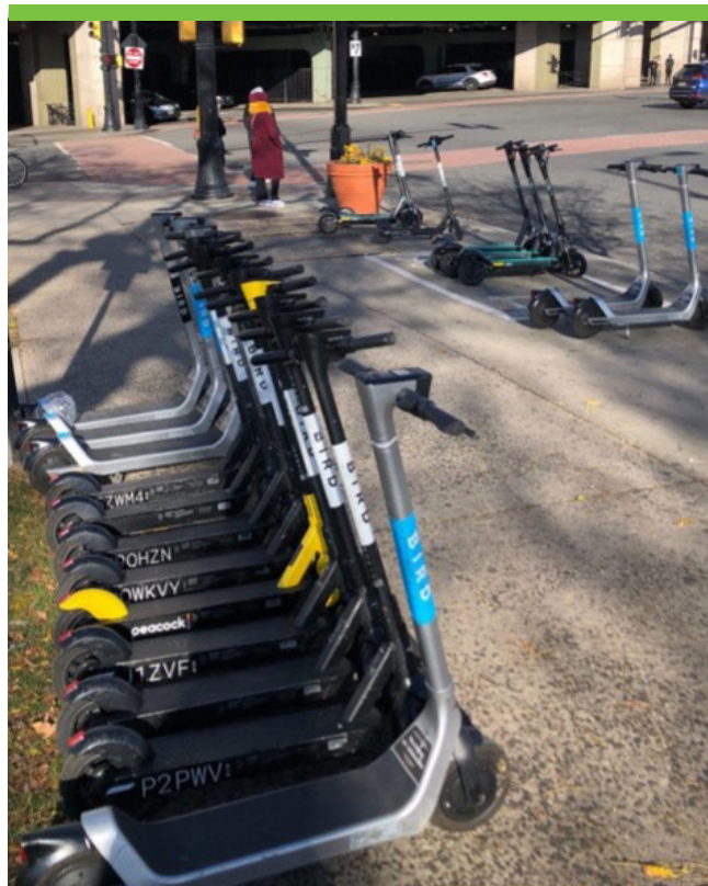
E-scooters located outside of Penn Station in Newark, NJ.