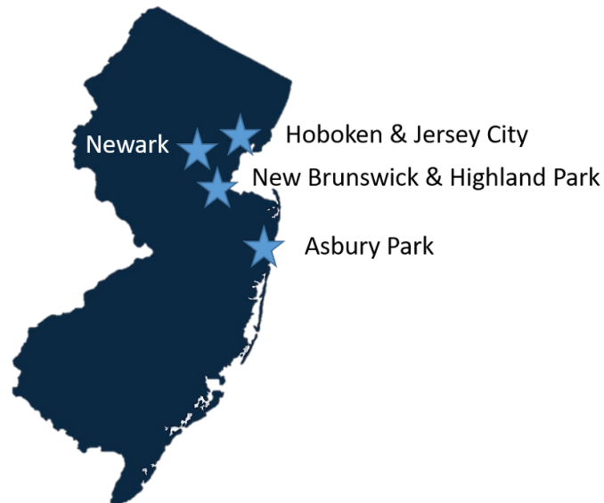
This map of New Jersey shows locations where the Rutgers University research team may operate during its 3-yr project.

For these experiments, the research team seeks to apply its near-miss detection technologies in realtime through the creation of a virtual reality environment that simulates connected traffic cameras as well as pedestrian, e-scooter, and driver apps. These cameras and smartphone apps identify pedestrian, e-scooter, and vehicle locations; predict their moving trajectories; determine potential collision danger; and provide warning alerts to pedestrians and drivers of e-scooters and motor vehicles. The e-scooter app can also potentially regulate e-scooter speed.