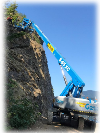
Below Left: Delivery of plates to be used for the rockfall protection barrier.