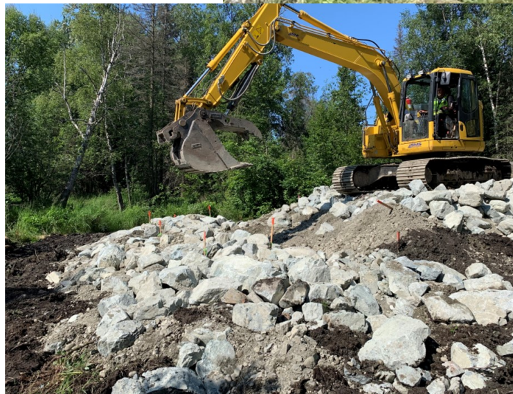
Left: Placement of Riprap on the North Fork