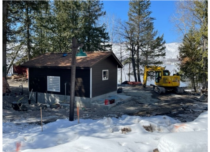
Lake McDonald Lift Station NE Elevation