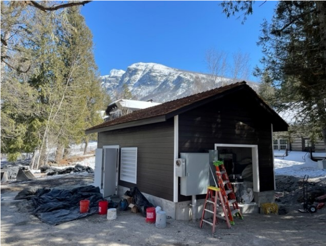
Lake McDonald Lift Station SW Elevation