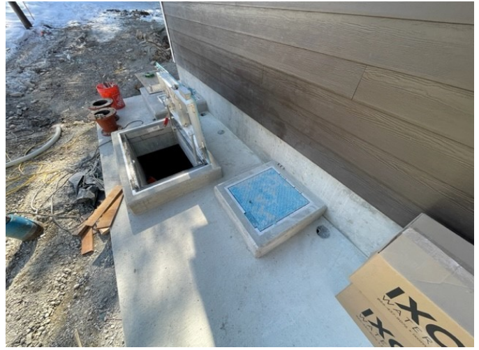
Lake McDonald Wet-Well Hatch Installed