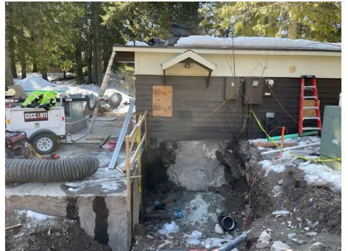
Sprague Crk Lift Station Yard Piping Excavation