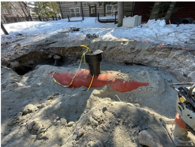
Lake McDonald Propane Tank Install