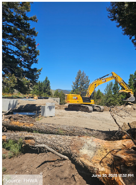
Embankment and Drain System Installation at Abutment 2.