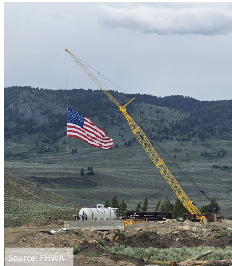
Celebrating Independence Day