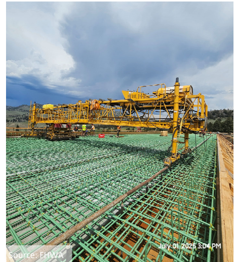
Bidwell installation for upcoming deck pours.