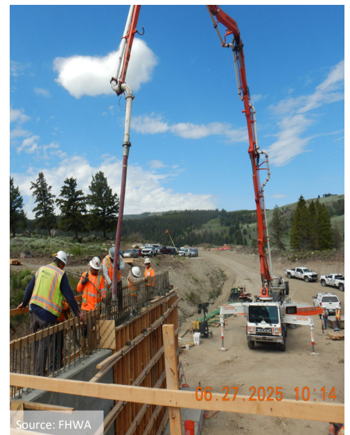
Wingwall B Pour at Abutment 1.

Project Website: https://highways.dot.gov/federal-lands/projects/wy/nps-yell-12-2