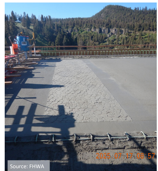
Final Result for Stamped Crosswalks.

Project Website: https://highways.dot.gov/federal-lands/projects/wy/nps-yell-12-2