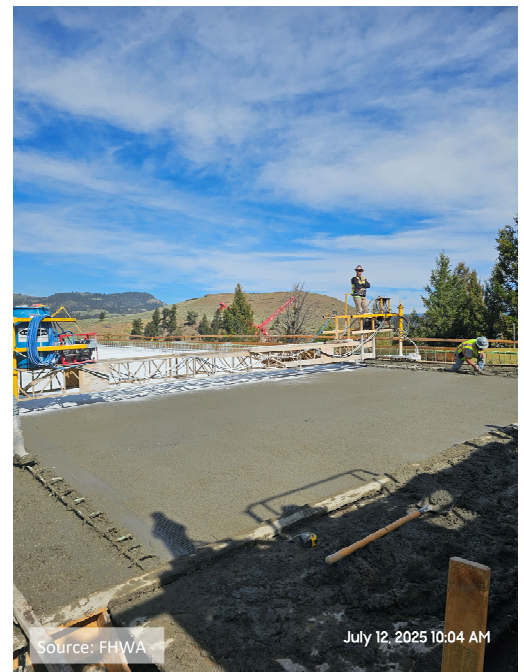
Start of Second Pour.