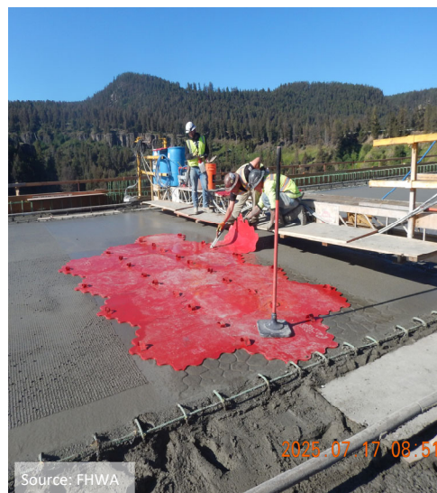
Stamp Concrete process for Crosswalks.