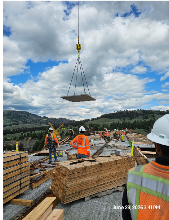
Precast Deck Panel installation at Span 2.