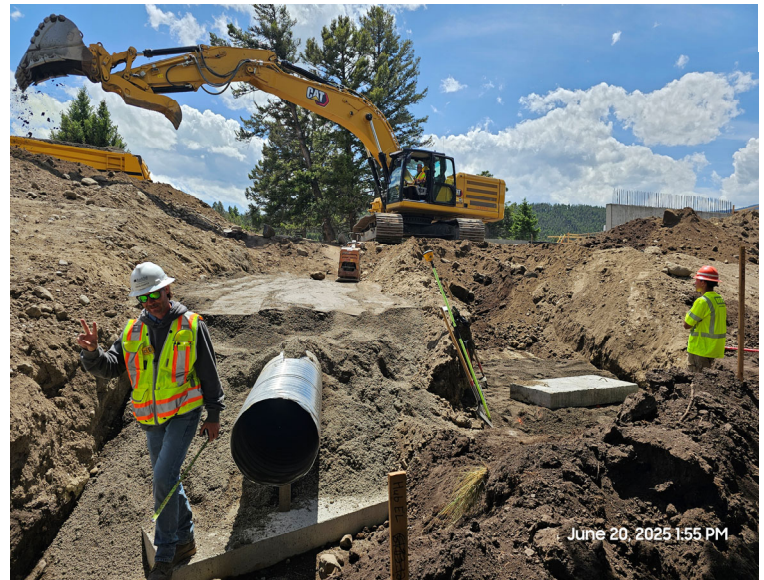
Culvert Drainpipe installation at Abutment 2.