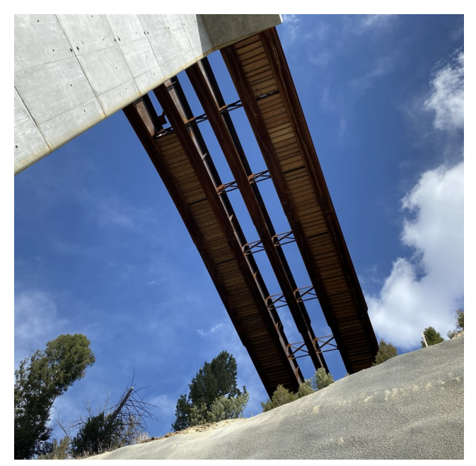
False decking in bays 1 & 4. Picture from between Pier 3 and soil nail wall