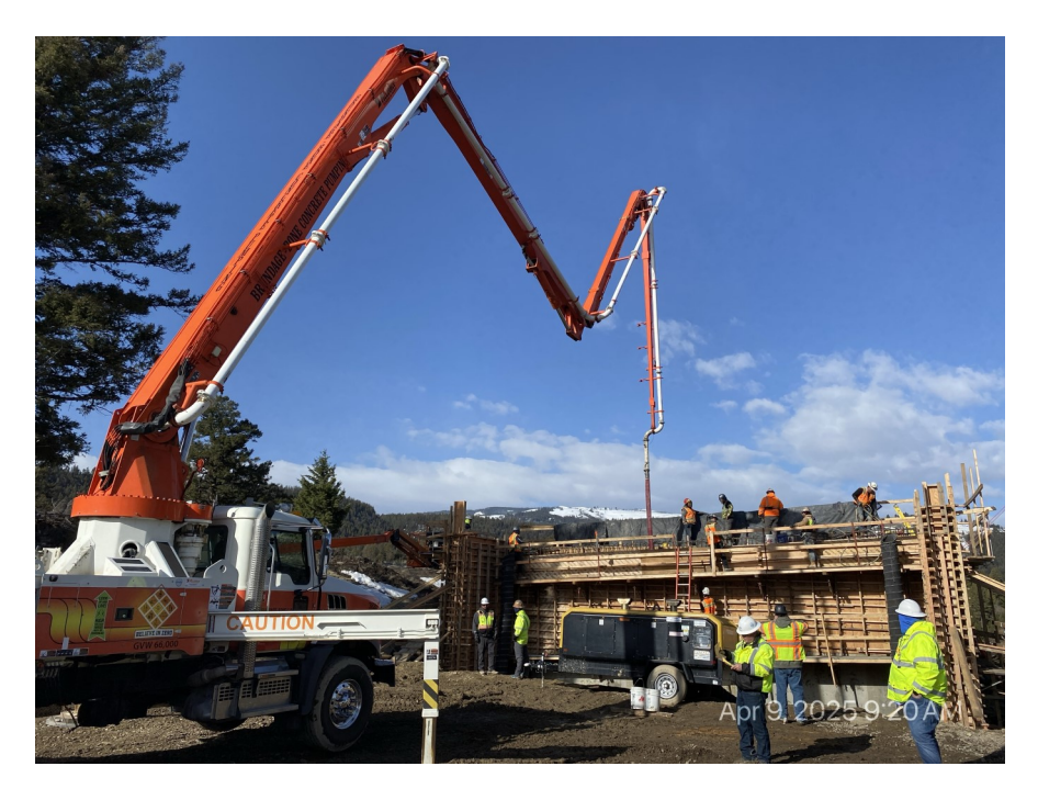
Daytime picture of concrete pour at abutment 2