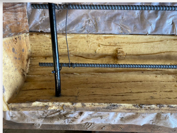
Forming the Precast Mold