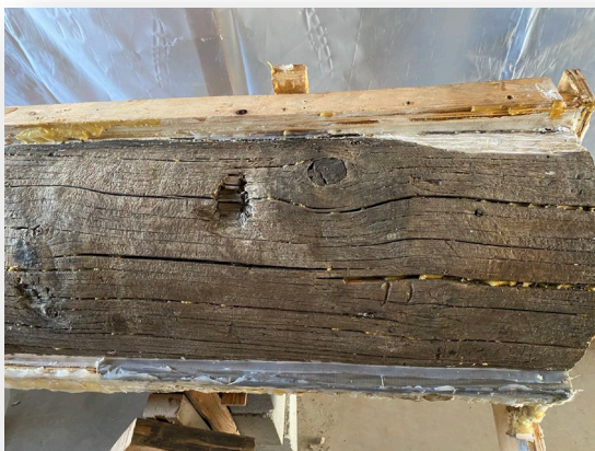
Salvaged Timber from the Project Parking Lot