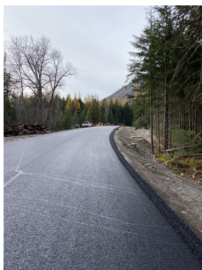
Upper McDonald Creek Rd Paving Operations