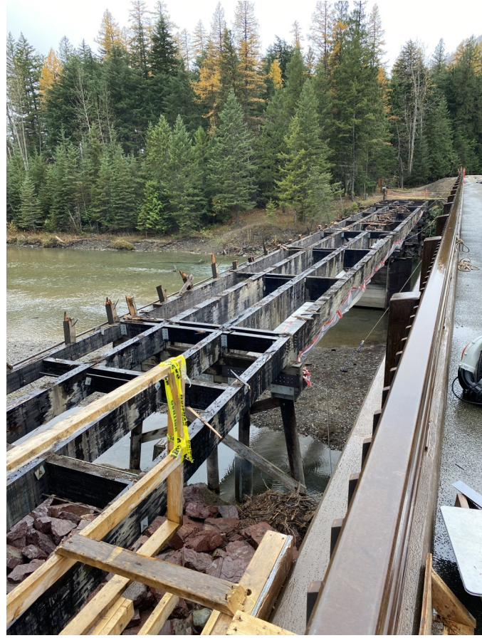
Upper McDonald Creek Bridge Demolition