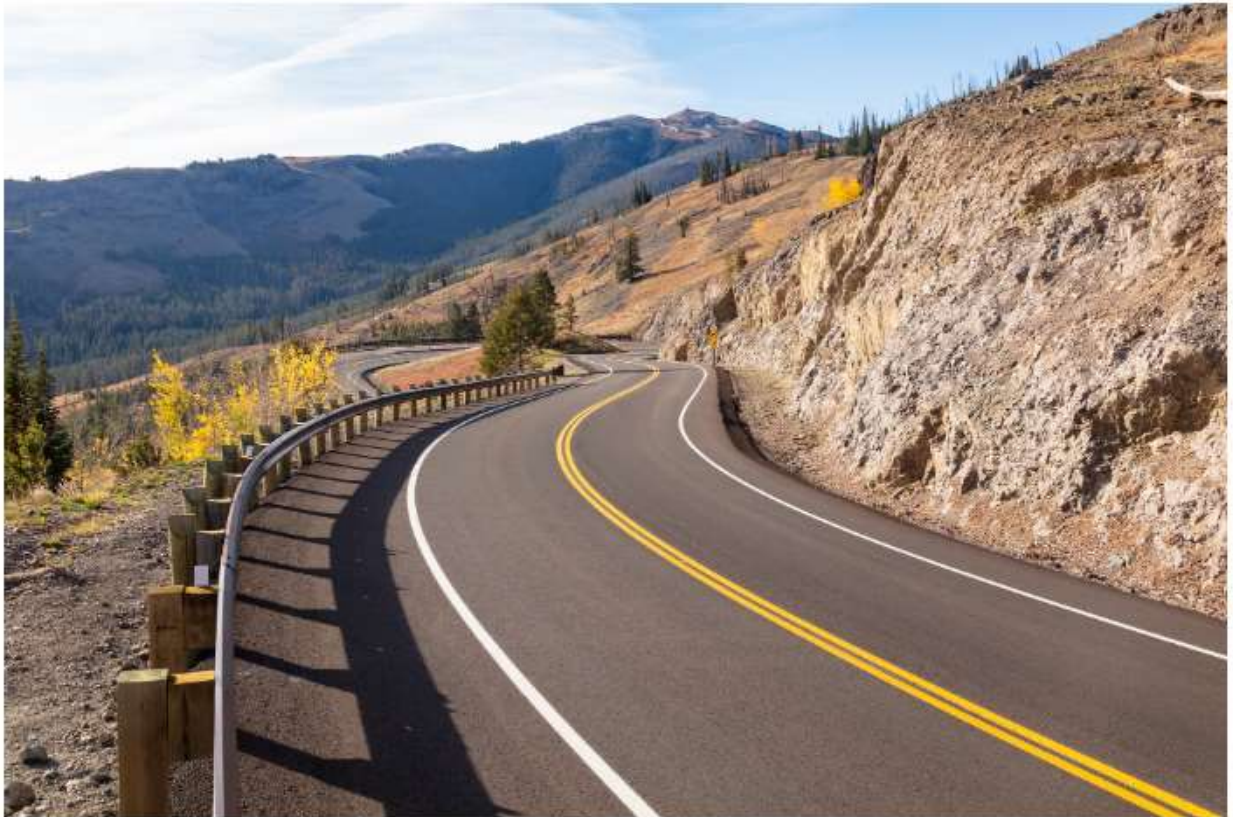
Road reconstruction made possible with a NSFLTP program grant.