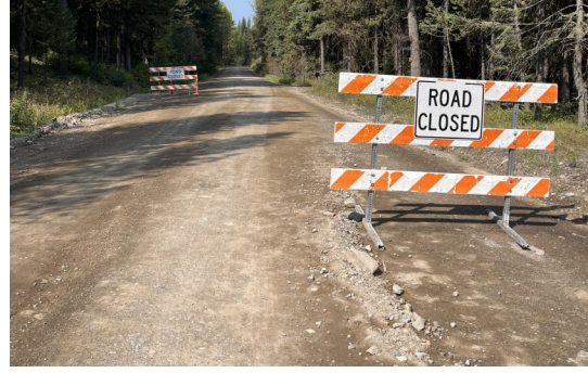
Barriers at Edge of Work Zone