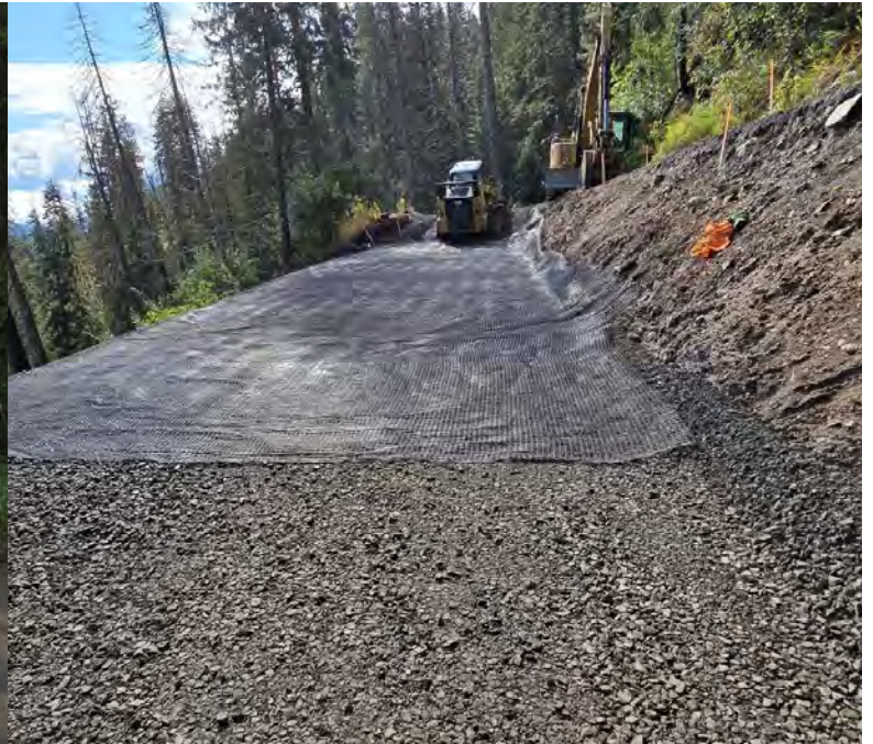
RSS wall construction, M.P. 2.52 FSR 470