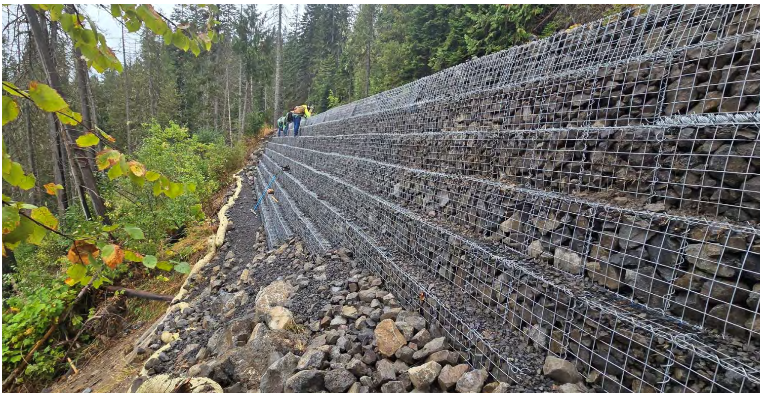
RSS wall construction, M.P. 2.52 FSR 470