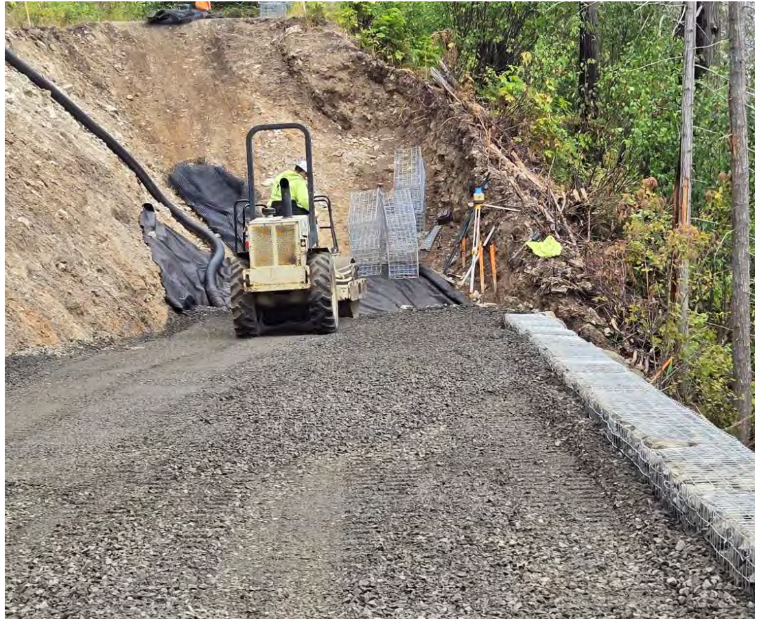
RSS wall construction M.P. 2.52 FSR 470

FSR470, Swiftwater Road, remains closed to thru traffic from the Selway River to the junction of FSR653. At M.P. 2.52 of FSR470, Structural excavation is taking place and the road is not passable to any vehicles including emergency vehicles. FSR470 will remain closed to all thru traffic through at least the end of September.