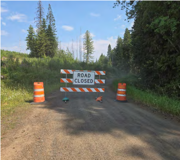
Road Closed sign, Junction FSR470 and FSR653