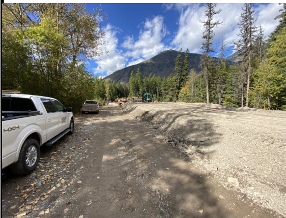
Approach road embankment

GTSR — Ongoing erosion control maintenance. Striping work as well as turf establishment to occur in the coming weeks.