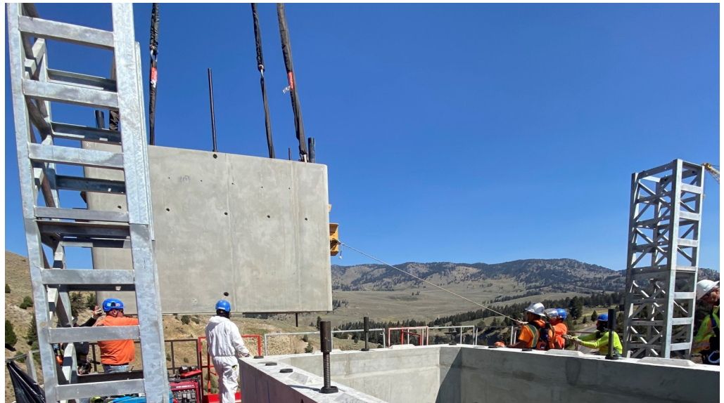
Final Segment of Pier 2