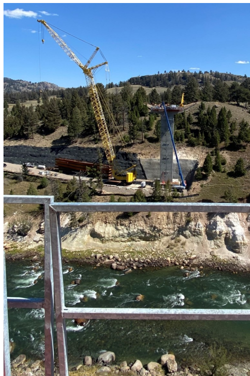
Pier 3 From Pier 2 Top