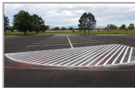
Pavement Markings Lovell Visitors Center