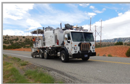
Pavement Markings Bad Pass Road