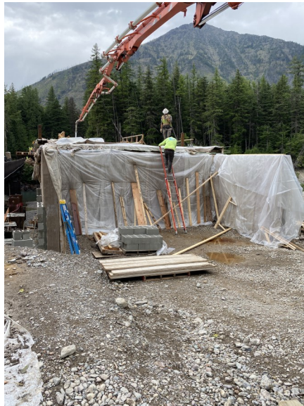
Abutment 1 curing

GTSR — Ongoing erosion control maintenance. Turf establishment to occur in the coming weeks.