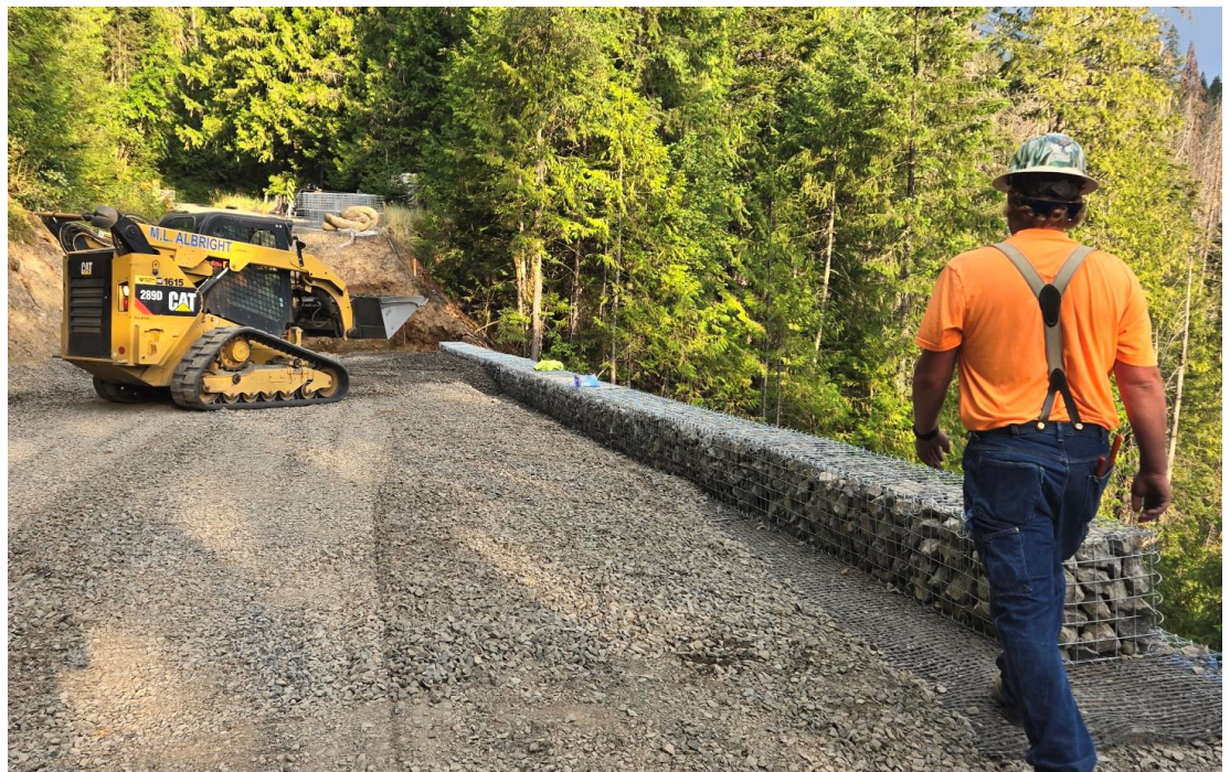
Gabion wall construction M.P. 2.36 FSR 470

FSR470, Swiftwater Road, remains closed to thru traffic from the Selway River to the junction of FSR653. At M.P. 2.36 of FSR470, roadway excavation has taken place and the road is not passable to any vehicles including emergency vehicles. FSR470 will remain closed to