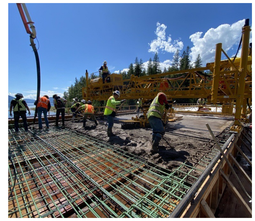
Second deck pour