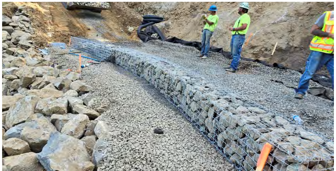
Reinforced soil slope Gabion Faced wall construction FSR5503

FSR 5503 is currently closed and will remain closed at the junction with Highway 12 at M.P. 87.5 until construction operations are concluded. Please be aware of potential heavy truck traffic entering and exiting onto the highway and refrain from entering the work area. Please refer to local news outlets on Monday July 1, 2024 for updated information on current and future road closures including road closure dates for FSR470 and FSR469.