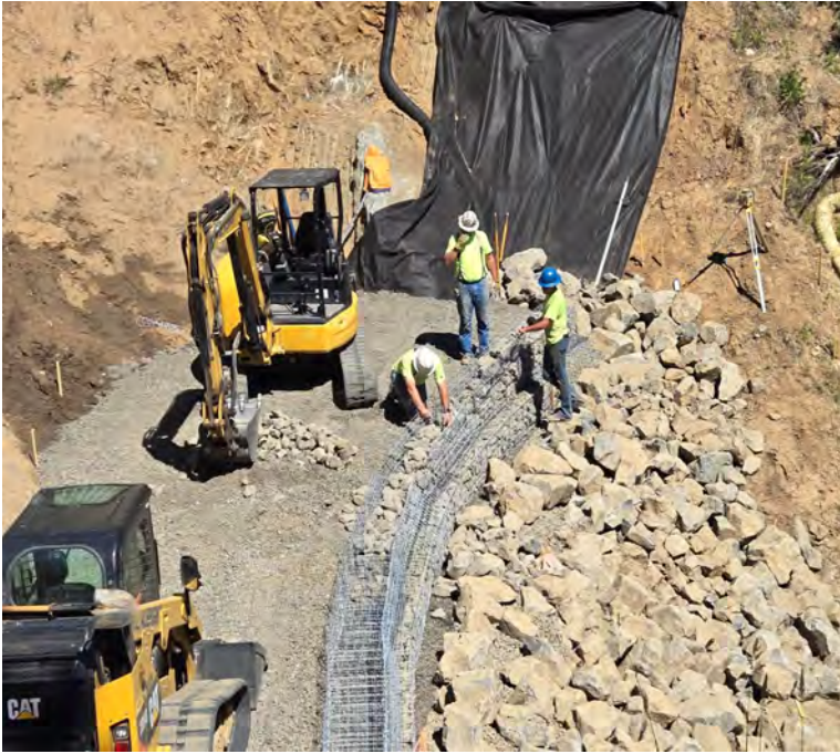
Wall Construction, FSR5503 M.P. 1.28