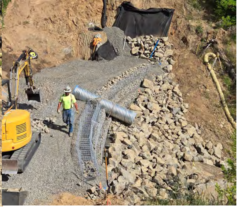
Culvert wall penetration, FSR5503 M.P. 1.28