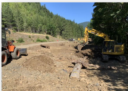
East Meadow Landscaping Continues