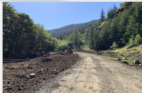
Skim Coat in West Portal