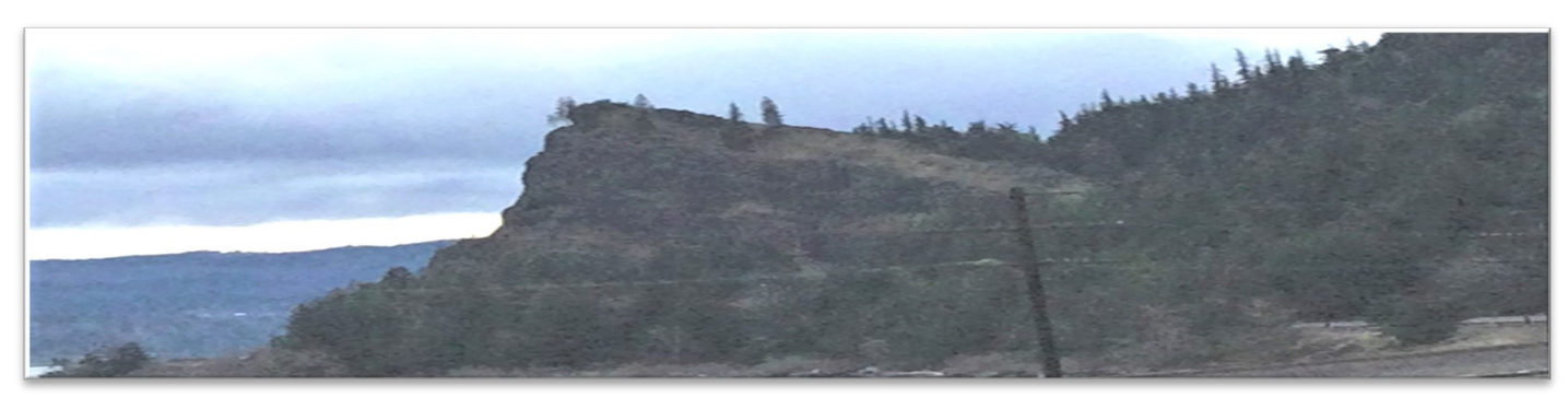
April 15, 2024