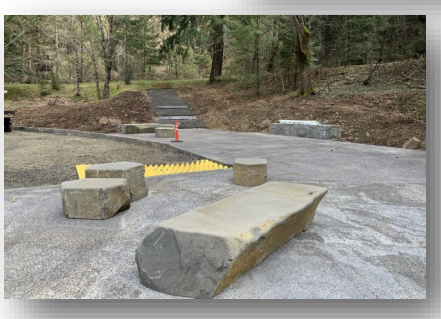
Hexagonal Basalt Bench in Plaza Area