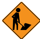
Topsoil and Boulder Placement at East Meadow