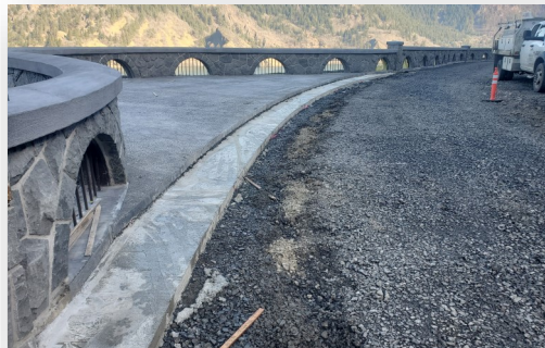
Basalt Band Foundation at West Overlook