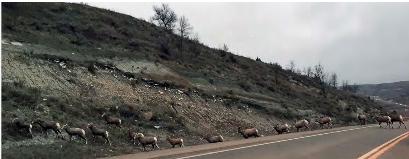
Figure 7. Photograph. Wildlife crossing the roadway along US 85.

In addition to the concerns noted in the project needs, the Affected Environment section of the EIS made a connection between safety and ecological connectivity (NDDOT, 2017; figure 7). This analysis informed mitigation measures related to WVCs documented in the EIS.