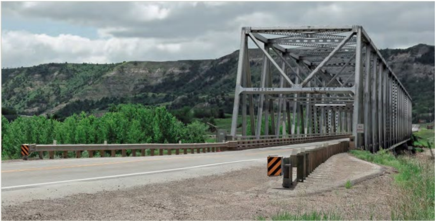
Figure 3. Photograph. Long X Bridge.