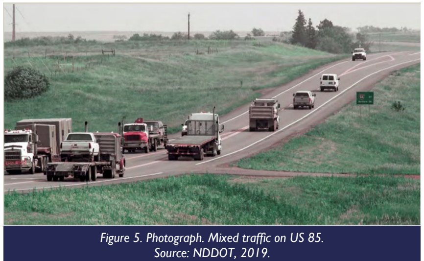
Figure 5. Photograph. Mixed traffic on US 85.

Some of these concerns were reflected in the crash data—6 out of 10 reported fatal crashes between 2010 and 2015 involved head-on collisions. Furthermore, the Wildlife Crossing/Accommodation Volume I: Need and Feasibility Assessment technical report cited wildlife carcass data that suggested WVCs were an issue for the corridor (NDDOT, 2017). Crash costs associated with deer species alone accounted for roughly $200,000 in societal costs annually, and the monitoring effort (2014/2015) also observed other species involved in vehicle collisions (e.g., Pronghorn, elk, coyotes, and bighorn sheep).