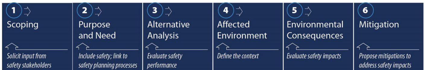
Figure 1. Graphic. Steps of the NEPA process covered by this case study.