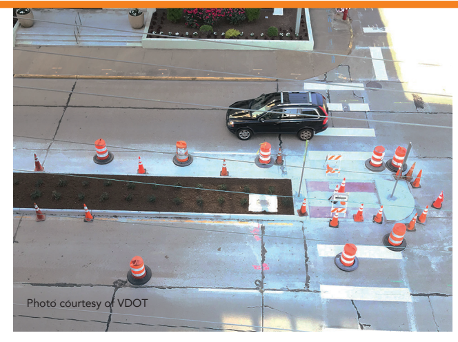
Pacific Avenue, Virginia Beach PSAP Improvements

edestrian safety is a major concern in Virginia. Between 2012 and 2016, over 450 pedestrians died and over 8,000 were injured while walking along or across Virginia's public roads. Over 90 percent of Virginia's pedestrian crashes occur when the pedestrian is crossing the street. More than half (62% of crashes)