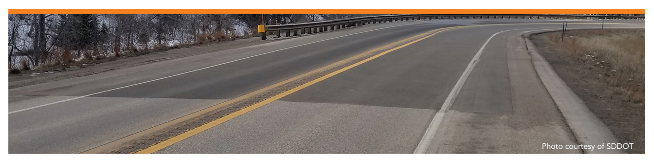
HFST applied at horizontal curve on US Highway 14A through Boulder Canyon west of Sturgis, South Dakota.

The Result: A 77-80% crash reduction at the test project locations, yielding a 12:1 benefit-cost ratio.