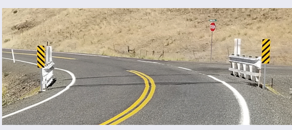
Full striping (centerline and fog lines), system wide sign evaluation and upgrades, delineators, vertical panels, guardrail, roadside hazard mitigation, alignment correction, sight distance improvements.

improvements, and develop a process for prioritizing investments.