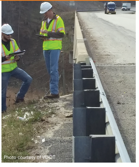
Guardrail teams assess a high priority guardrail using the VDOT Guardrail Tracker

To meet these challenges, in 2016, VDOT established a new data- and risk-based strategic guardrail management program and leveraged data and technology to drive institutional changes in policy, inventory, process, and supporting management tools. For instance, leveraging technology, VDOT collected a complete statewide guardrail terminal inventory with detailed manufacturer and product information within a few months and at a nominal cost. A new Guardrail