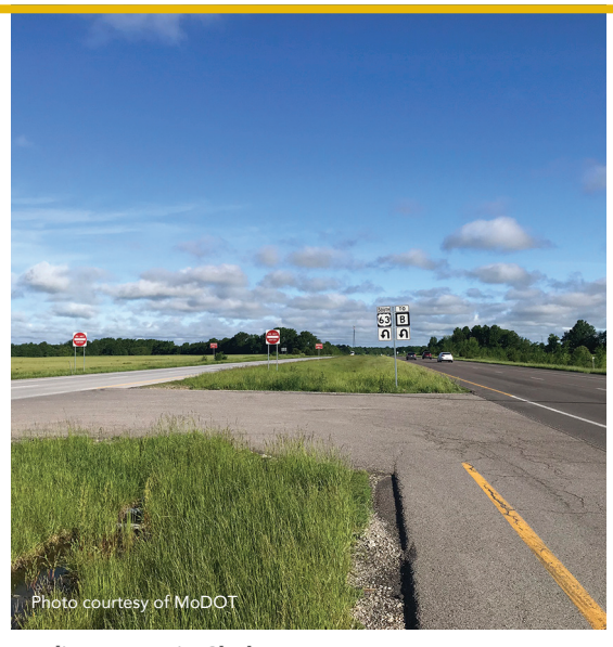
Median U-turn in Clark (intersection of US 63 and Routes B/P)

Median U-Turn intersections eliminate side road crossing and side road left turn movements at intersections on four-lane expressways. The intersections require side road traffic to turn right, merge into oncoming traffic, then merge to a median deceleration and U-turn movement to cross or make what