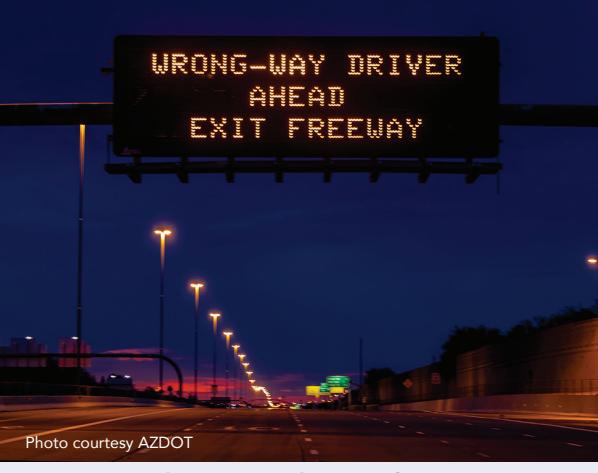
Wrong-Way Pilot DMS Display to Right-Way Drivers

Installed along a 15-mile stretch of I-17 in central Phoenix, the $4 million system consists of 90 FLIR thermal cameras positioned throughout the corridor to detect wrong-way vehicles, illuminated "WRONG WAY" signs for enhanced notification to the wrong-way driver, geofenced alerts of incoming danger to right-way drivers through overhead boards and the ADOT Alerts