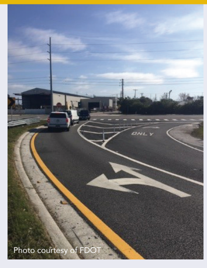
I-275 NB Off Ramp and SB On Ramp at 31st St

contracts (in which designer is working in close coordination with the construction team) with the time savings of push-button contracts (in which pre-selected push-button contractor is able to quickly get to work since all of the contractual paperwork is already in place). In the design-build scenario, the designer and the construction contractor are working together on the same team, so there are no misunderstandings about the what and the how of the project. The project also gets built faster, as construction activities can begin while some parts of the plan are still being finalized. In the