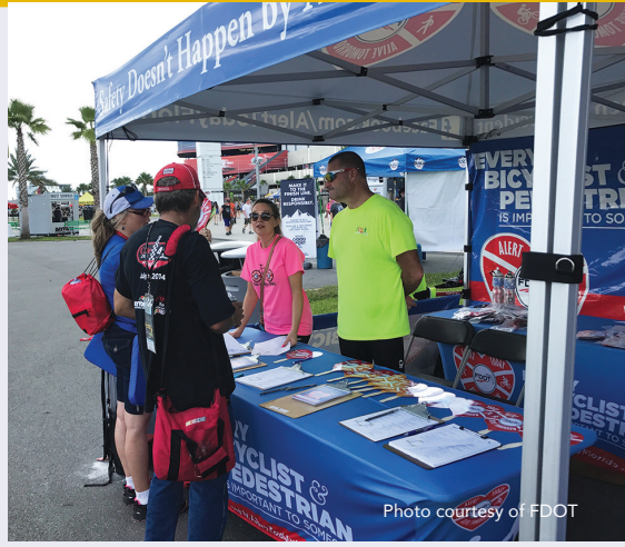
Participants fill out surveys and/or pledges to receive a pedestrian and bicycle safety bag of educational information.

(PBSSP) and formed the Florida Pedestrian and Bicycle Safety Coalition to vigorously implement the plan. Alert Today Florida adopted a data-driven approach to use available resources to achieve the most tangible results, focusing on engineering, education, enforcement, and emergency medical services, while prioritizing areas with the highest representation of traffic crashes resulting in serious and fatal injuries to pedestrians and bicyclists.