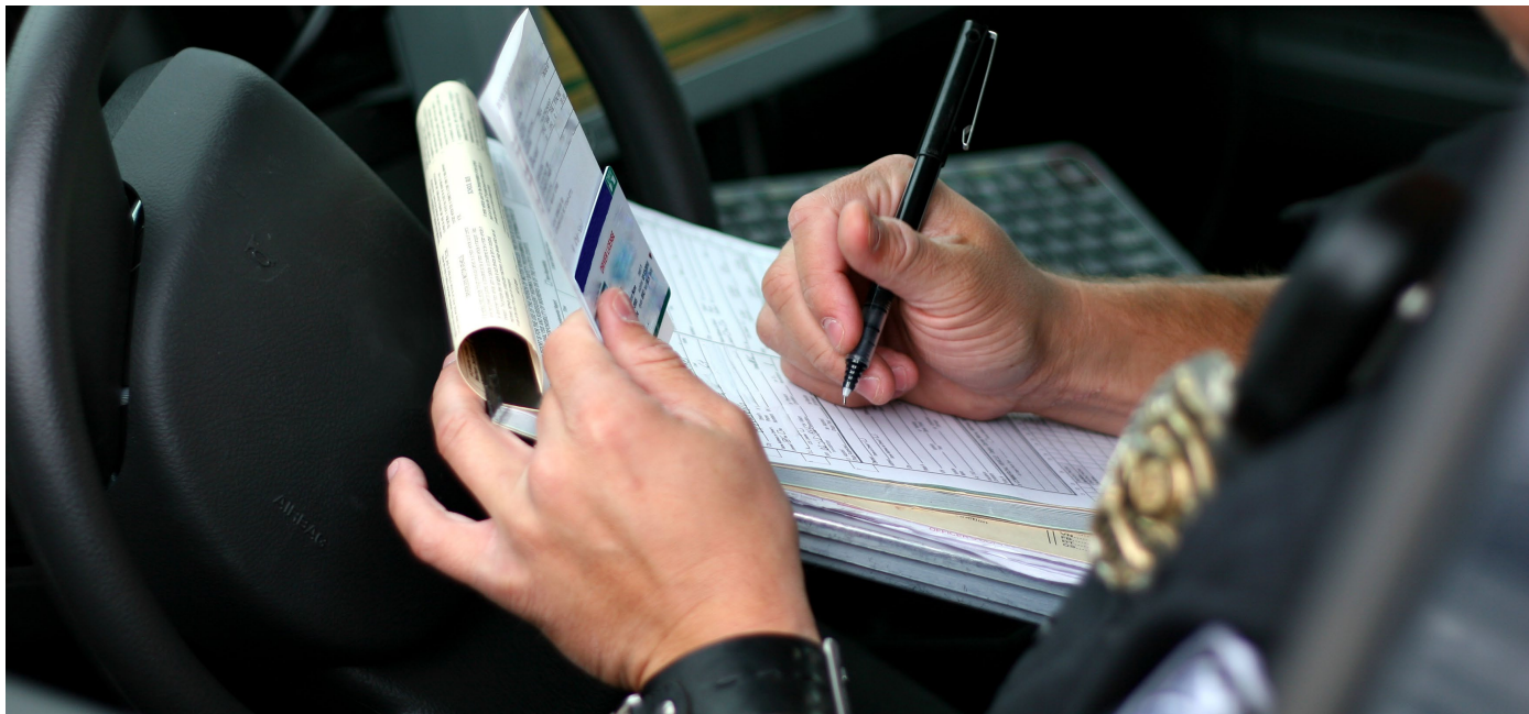
Officer uses driver information to complete a traffic ticket.