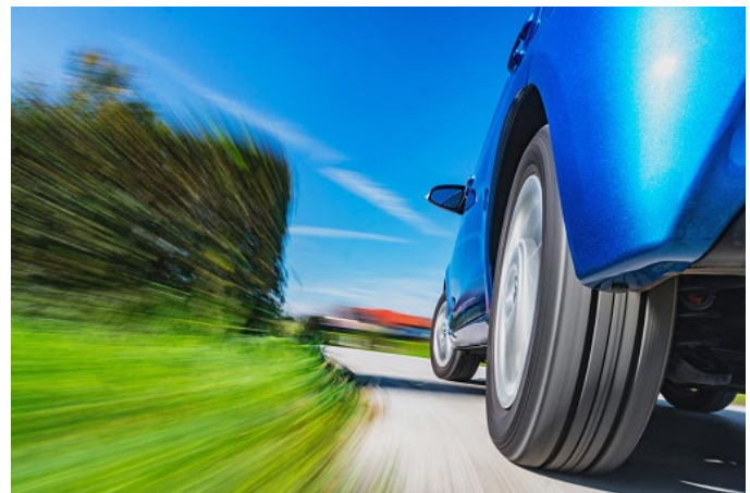
Speeding Vehicle.

While it is important to address these crashes, solutions should focus on the root cause of the crash when feasible. Countermeasures geared specifically towards speeding, such as Dynamic Speed Feedback Signs (DSFS), lane narrowing, or use of landscaping, may be less effective when the driver is impaired. Rather areas with a high number of impaired crashes should be targeted with countermeasures that address the impairment, such as enforcement.