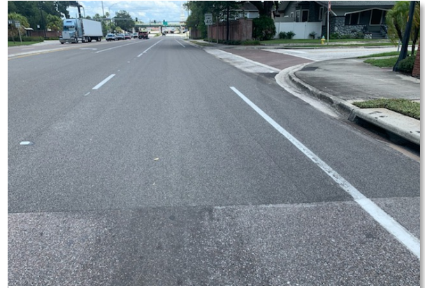
HFST on Hillsborough Ave. at Central Ave.

The Tampa region of Florida Department of Transportation (FDOT) has a long history of using Road Safety Audits (RSAs) to assess potential safety enhancements at intersections. As part of a recent RSA, FDOT included continuous pavement friction measurement (CPFM) data. With friction and crash data in hand, the RSA team was able to more closely examine pavement-related factors that could explain higher-than-average crashes at this intersection. In particular, the resolution of the CPFM 1 data allowed the RSA team to posit that lower pavement friction when compared to the surrounding pavement was likely a significant factor under both wet and dry conditions at the critical approaches to the intersection stop line and crosswalk. In response, FDOT initiated a project to apply High Friction Surface Treatment (HFST) to the intersection approaches and within the intersection itself.