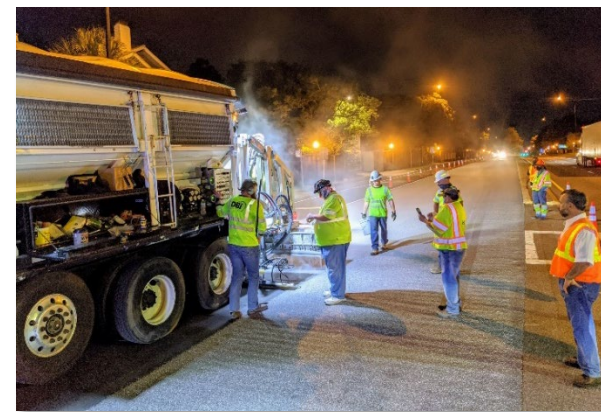
Application of HFST to Hillsborough Ave. using fully-automated installation.

and Central Ave. in Tampa, Florida. From 2015-2020 there were approximately 13.5 crashes per year at this intersection, with the vast majority (86 percent) being dry pavement crashes and the predominant crash type (68 percent) being rear-end crashes. Just over 2,700 square yards of HFST were applied to the left-turn lane and two thru lanes during two consecutive nighttime installation operations, minimizing disruption to the traveling public. Friction testing after completion of the installation revealed that HFST more than doubled pavement friction at the intersection approach.