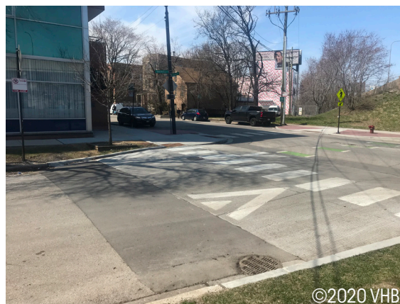
Figure 2. Photo. Raised crosswalk in Chicago with additional drainage grates added upstream of crossing.

Agencies should also consider the placement of raised crosswalks along transit routes because of the potential effect on transit vehicle speeds. The FHWA Traffic Calming ePrimer notes that raised crosswalks can be used on bus routes where the operating speed is 25 miles per hour (mph) or lower (raised crosswalks can normally be implemented on roadways up to 30 mph). Additionally, raised crosswalks should not be placed near bus stops. This is to avoid the risk of passengers falling while transitioning between sitting and standing as the bus traverses the raised crosswalk. 7