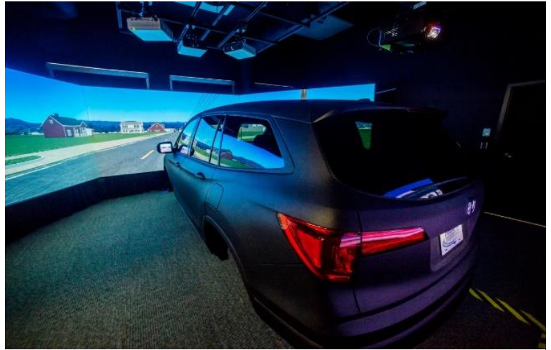
The UAB TRIP Laboratory's Driving Simulator Facility.