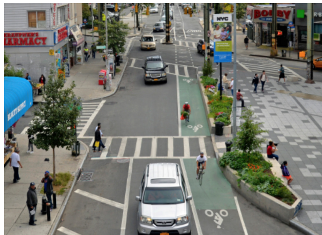
Pavement markings separating pedestrians, cyclists, and drivers near the corner of Knickerbocker and Greene Avenues in Brooklyn. From the 2017 New York City Safer Cycling report, http://www.nyc.gov/html/dot/downloads/pdf/bike-safety-study-fullreport2017.pdf .