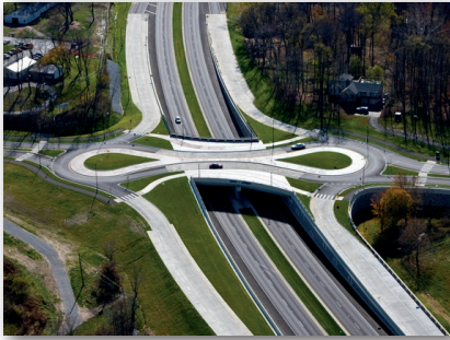
Figure 2: Overhead photo of the completed roundabout installed above the Keystone Parkway at 136th Street.