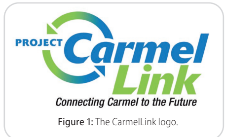
Figure 1: The CarmelLink logo.