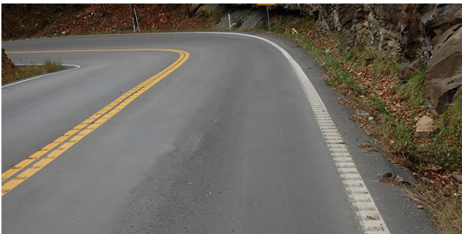
Figure 1. Center line and edge line rumble strips on a horizontal curve in Kentucky.

KYTC is building on the success of its Statewide RwD Action Plan with an ongoing RwD crash analysis at the District level. These studies will investigate each District's RwD safety challenges (e.g., risk factors and hot-spots) using a systemic approach and the State-specific SPFs to identify potential projects. KYTC has a goal to allocate HSIP funds 50/50 for systemic and site-specific projects across the State.