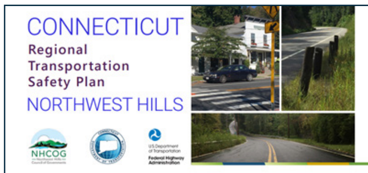
Figure 4. Cover of the Northwest Hills RTSP.

As a resource to implementing RTSPs, the Connecticut Technology Transfer Center's Safety Circuit Rider Program provides technical assistance to local agencies at no cost to municipalities. Activities include countermeasure research, educational programs, technical assistance, and various training opportunities.