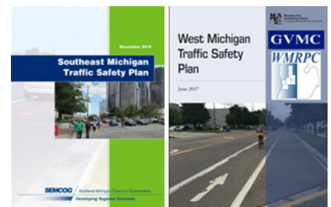
Figure 2. Example RTSPs in Michigan.

As a result of the RTSPs, Macomb County installed sinusoidal center line rumble strips on 50 miles of roadway and Kalamazoo County constructed 3-foot paved shoulders, removed trees, modified guardrail, improved ditching, and added edge line pavement markings to a 2-mile segment.