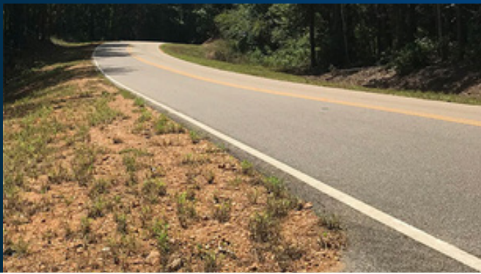
Figure 5. Before and after views of the Elmore County road safety project.