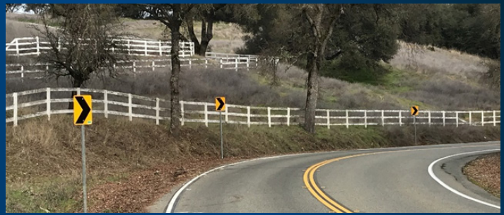
Figure 6. Chevrons are one countermeasure featured in many LRSPs.

Based on the success of Elmore County's plan, FHWA has been assisting 10 other counties in Alabama to develop LRSPs and the State plans to provide assistance to an additional 15 counties in the future using a combination of State Technology Investment Council (STIC) incentive and HSIP funding.