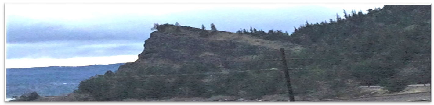
December 8, 2023