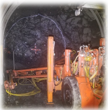
(All images) Source: FHWA