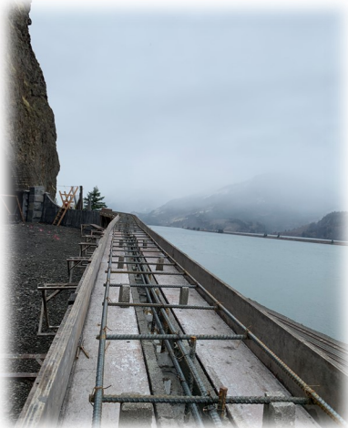
Left & Right: Rebar and form work at East retaining wall railing cap