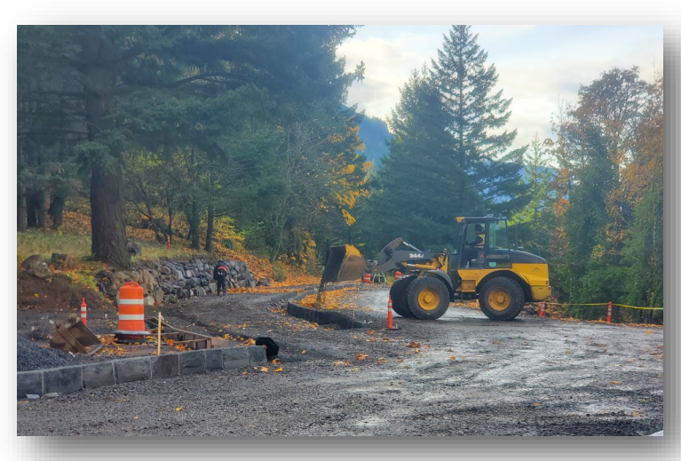
Stormwater Excavation- East Meadow