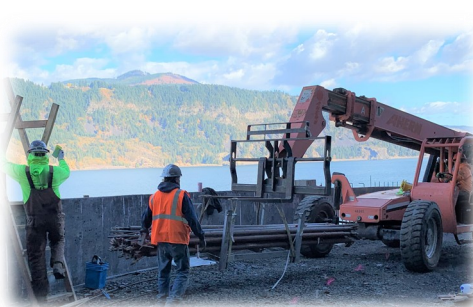
Below right: Concrete pouring retaining wall foundation at West bench