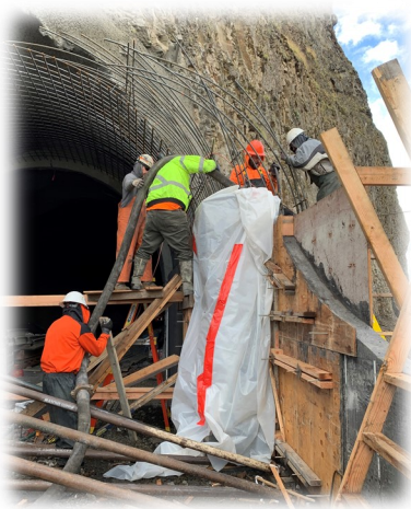
Below: Concrete pouring at North wing wall