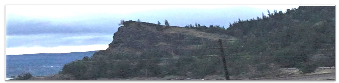
November 03, 2023