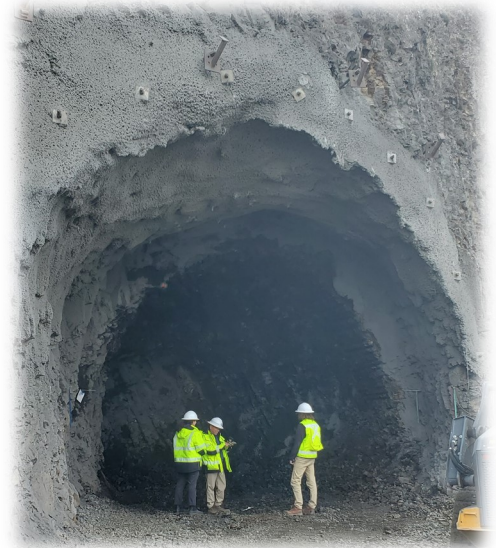
ALL: East portal