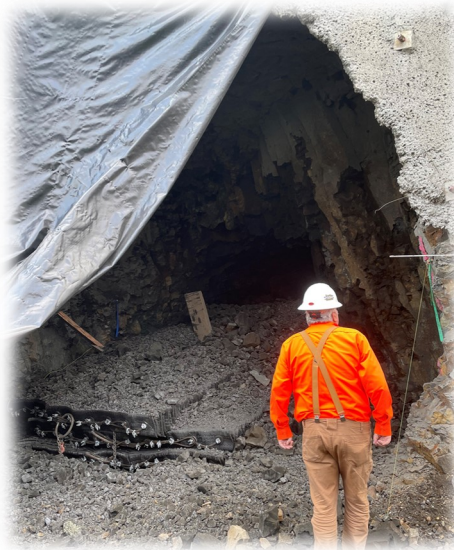
Left and Bottom Right: East portal - post blast