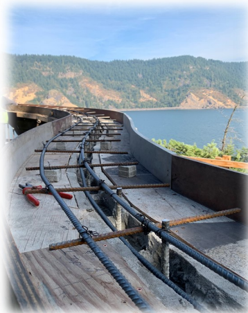
Left: East bench retaining wall cap rebar and forming