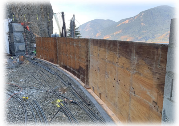
(All images) Source: FHWA