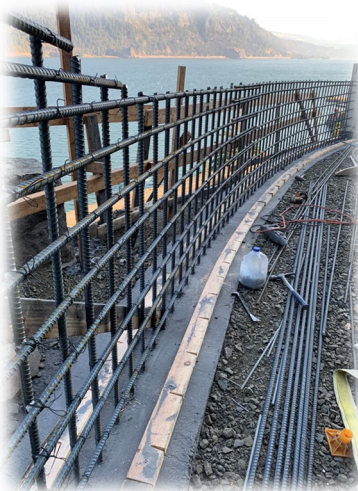
Below left and right: North wingwall rebar and form work