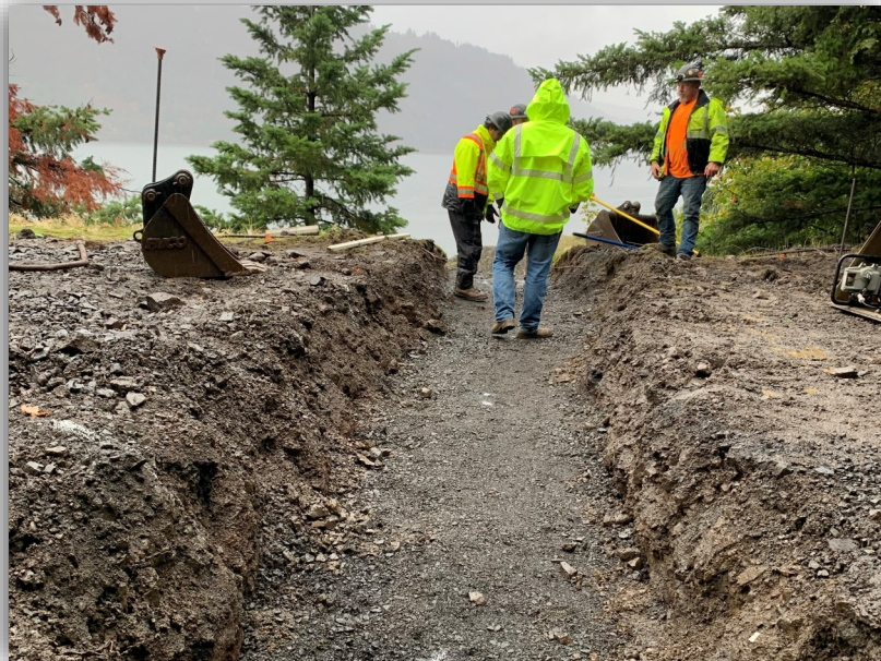
Below: Drainage Excavation in East Bench