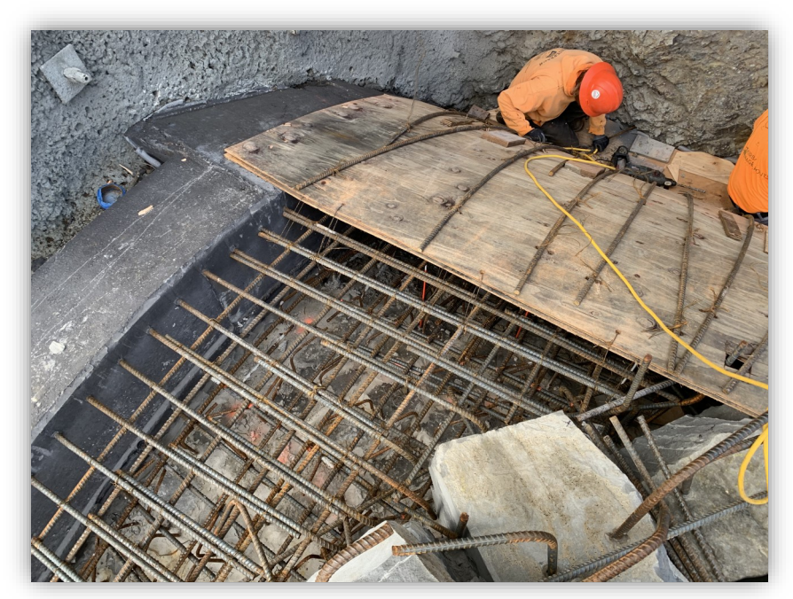
Concrete Forming and Pouring at West Portal of Tunnel