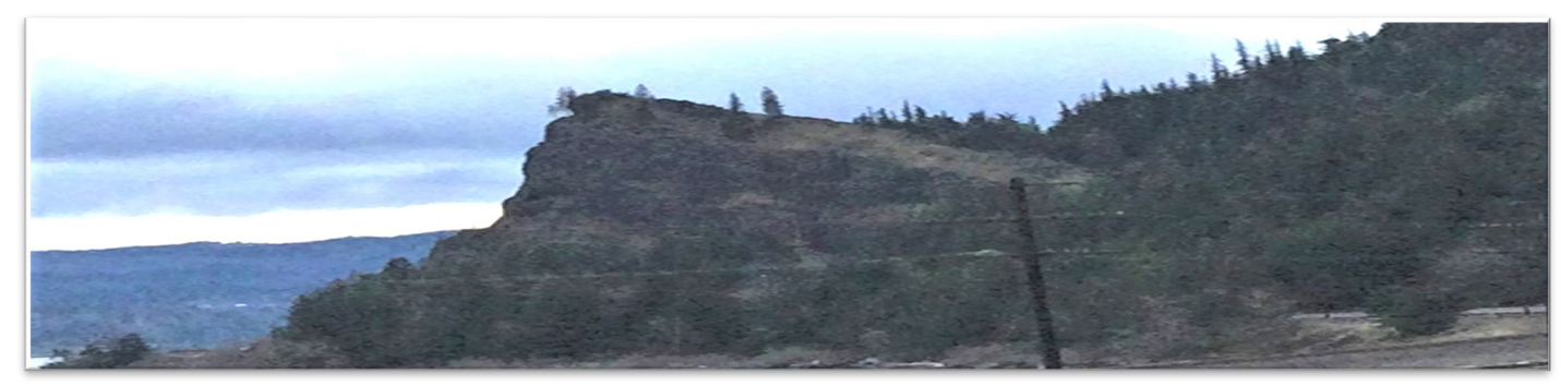
October 6, 2023